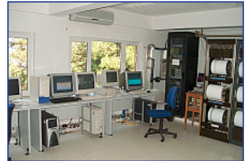
Secondary data centre

Another solution using GeoSIG products and a capable partner providing quality and reliability can also be cost effective.